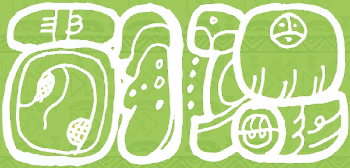
Mayan glyph that means: The patrimony of the people